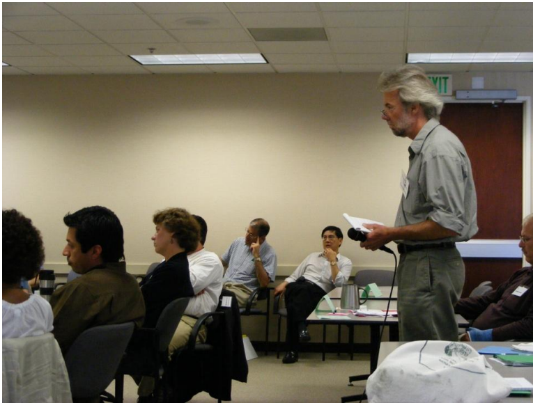
Oakland workshop Spring 2008