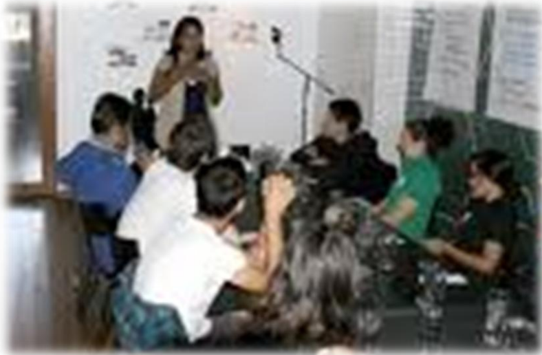
USC Daily Trojan