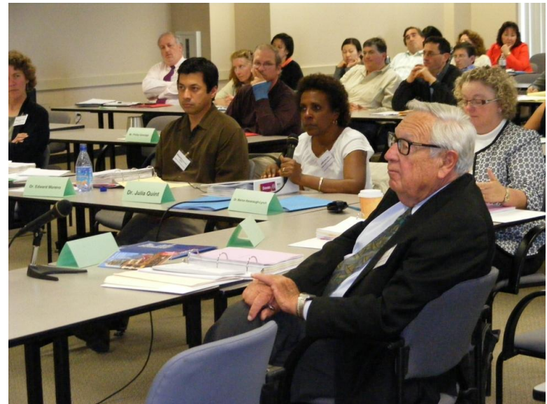
Oakland workshop Spring 2008