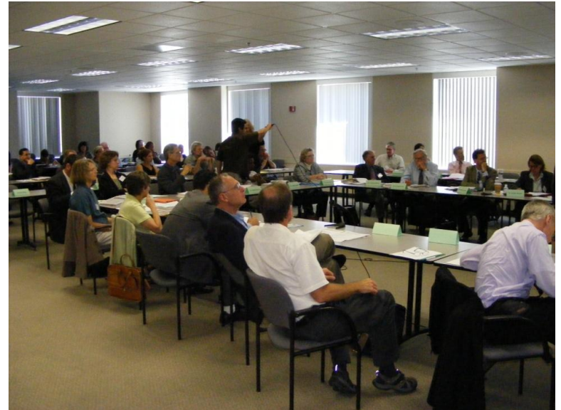
Oakland workshop Spring 2008